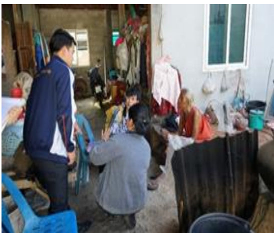
Figure 2: Prachakhom activity