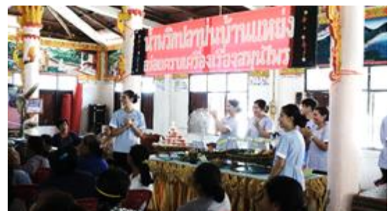
Figure 3: Ban Yang Elder Health Fairs