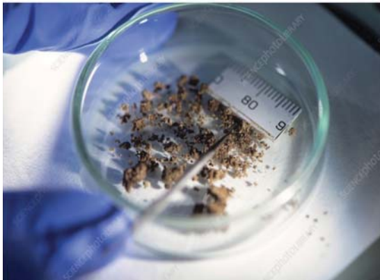
Microscopic analysis of soil sample

microspectrophotometry (MSP) and Attenuated Total Reflectance (ATR) Fourier Transform Infrared spectroscopy (FTIR) for discrimination of soil samples based on their organic and inorganic components (Woods Brenda et al., 2014). For elemental analysis of soils, X-ray fluorescence spectroscopy (XRF) and scanning electron microscopy/energy dispersive X-ray spectroscopy (SEM/EDX) are frequently used in forensic laboratories to detect differences in the elemental compositions of soil specimens.” (Woods et al., 2014)