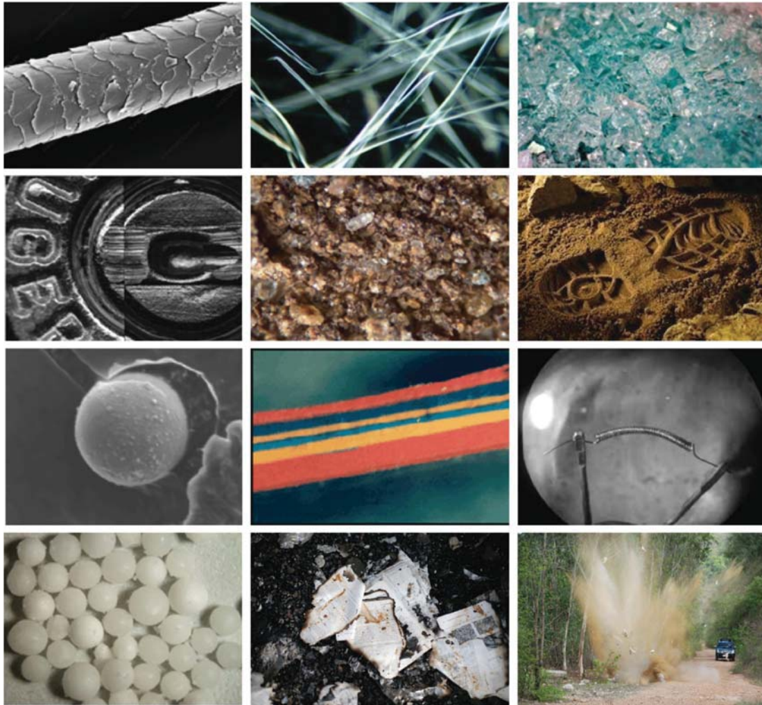
Fig. 1 Types of trace evidence

and underutilized, since its detection and collection are often neglected. This is because small pieces of evidence may not be visible to the naked eye of investigators; they may lack knowledge and understanding of trace evidence; collection of trace evidence is time-consuming and labor-intensive; it is a costly use of resources, and there are challenges in its interpretation (Stoney & Stoney, 2015). In comparison to DNA and fingerprints, trace evidence is considered to have a lesser identifying value where it can only be used to exclude an individual from an investigation but cannot directly link or identify