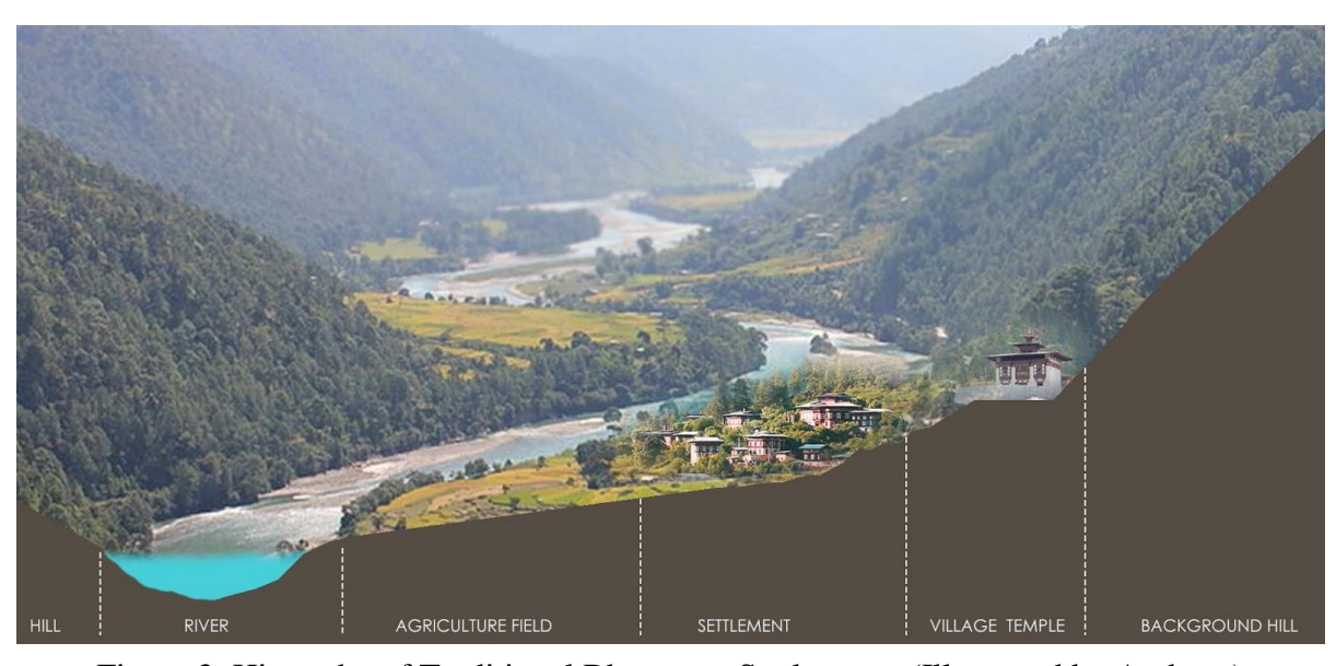
Figure 3: Hierarchy of Traditional Bhutanese Settlements (Illustrated by Authour)

For any land use planning, the Water Regulation of Bhutan 2014 mandates a compulsory transitional buffer of 100 feet long on both sides of a river where none of developments and building constructions is permitted. It is very likely that this figure of