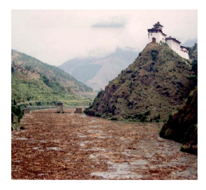
Figure 2: Flows of debris caused by GLOF in 1994.

along the large river valleys, the consequences of GLOFs would be severe and could impact on the nation as a whole, unless preventative measures are put in place. While a significant number of hydro-meteorological studies have been conducted on this subject, there isn't one that specifically focuses on land use planning and the interventions required to adapt to a GLOF disaster. This is particularly important when considering the role of land use in planning the distribution of settlements and infrastructure. A well-planned settlement would not only respond well to a disaster but also have the inherent capacities to adapt to it. Human settlement encompasses many sectors such as land, environment, climate change, disaster, etc., and it is important that the spatial planning of human settlement addresses the threat from the GLOFs and incorporates adaptive measures in the planning process. This paper examines and compares the various existing national policies, strategies, legislation and relevant factors and sets out the findings, conclusions and recommendations for the preparation of development plans to adapt to and mitigate threats posed by GLOFs. The threats from the GLOFs have been an important consideration in all planning processes and a study on this subject will go a long way in ensuring that our settlements are resilient and sustainable.